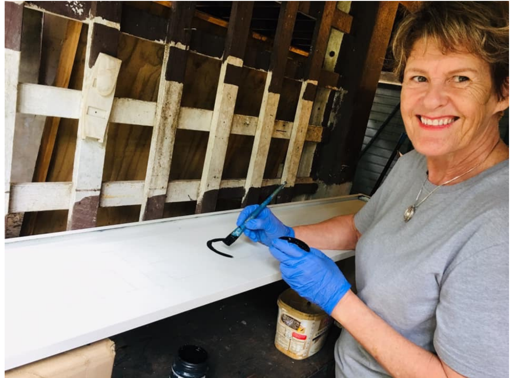
Collection points at Horseshoe bay and kindy